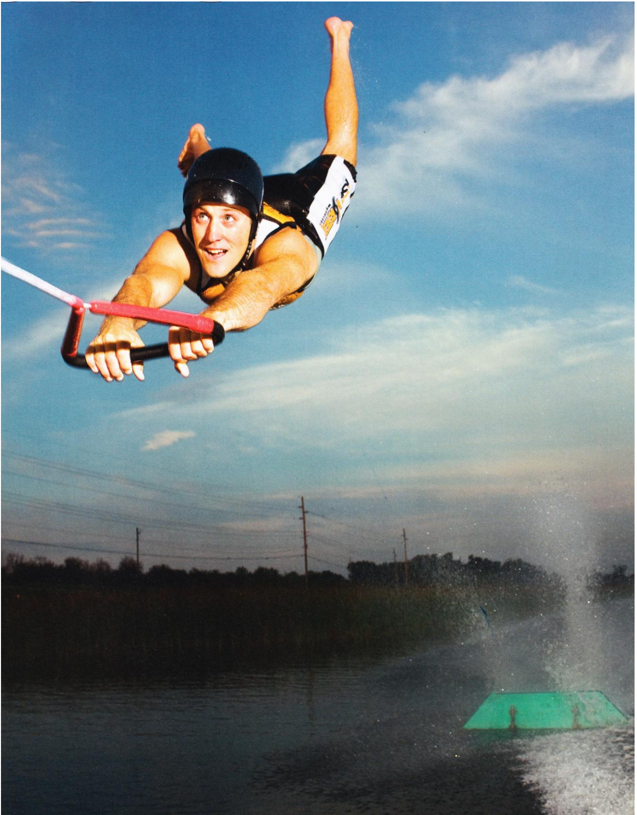
Keith St Onge (USA), World record breaker in slalom, tricks and jump