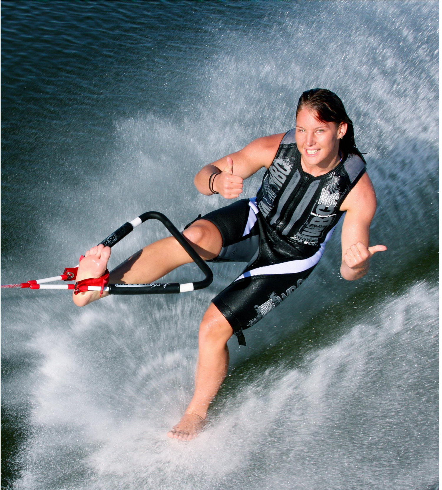
Ashleigh Stebbeings (Australia), World record holder in slalom, tricks and jump since 2014